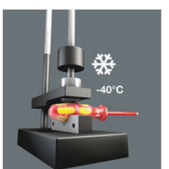
Impact strength tested at -40°C, guaranteeing safety even under extreme conditions.