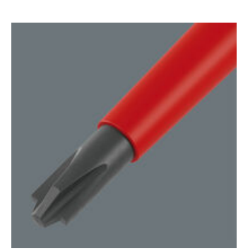
For the use in terminal blocks, control cabinets, switches, relays, sockets etc.

Wera produces the Kraftform handle out of several materials with different properties. A resistant plastic is used for the core which ensures that the blade is held securely even under high strain. A softer material is used for the coloured soft zones, which provides high frictional resistance and allows the transfer of high forces - resulting in less required screwdriving effort. The red sections with their hard surfaces prevent any "sticking" of the hand to the handle, making rapid repositioning of the hand possible.