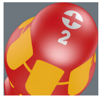
All Kraftform Plus screwdrivers are marked with their drive profile and size. This enables faster and more reliable selection of the correct tool from the tool case.